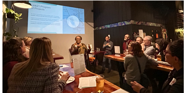
The Link21 Team presented to the Dogpatch Neighborhood Association in San Francisco on Nov. 11, 2023.

The Link21 Team created a logo and coaster for the Transit on Tap event hosted for Bay Area transportation advocates in Oakland on Oct. 25, 2023.