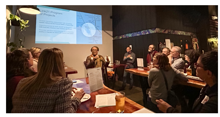
The Link21 Team presented to the Dogpatch Neighborhood Association in San Francisco on Nov. 11, 2023.

The Link21 Team created a logo and coaster for the Transit on Tap event hosted for Bay Area transportation advocates in Oakland on Oct. 25, 2023.